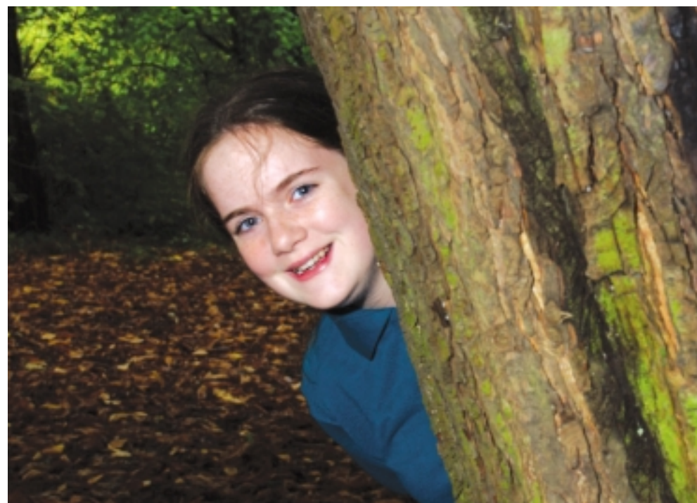
The new Scheme is aiming to encourage and inspire young people who wish to become Leaders

• Districts C and D are quite small Districts, and they share a District