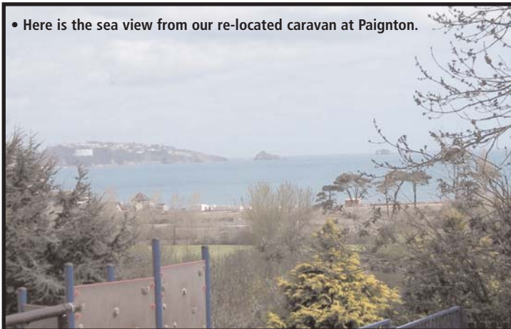
• Here is the sea view from our re-located caravan at Paignton.