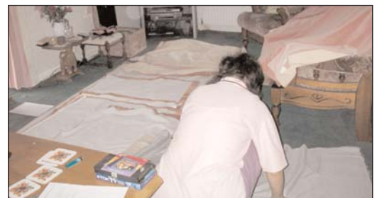
All will be revealed on page three!