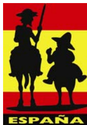
The District badge for Spanish BGAs