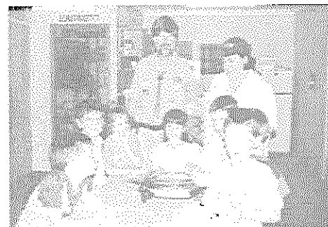
Joey Buddies - Brisbane