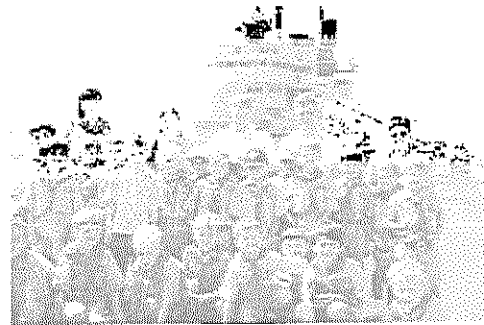
Camel Colony – HMS Illustrious