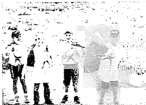
Dubai Desert Clean Up