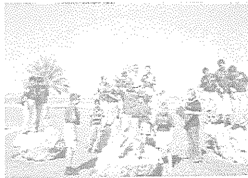
1st Abu Dhabi